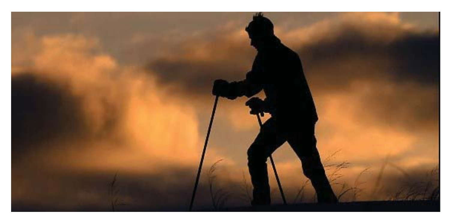
Made Possible By...

Assistance For Business Owners Looking To - Do More